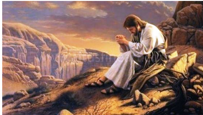
The Temptation of Christ

March 6 th , 2022 10:00a.m. First Sunday in Lent